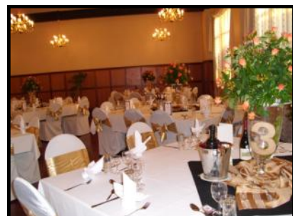
Flower bouquets were on each table as well as bottles of wine