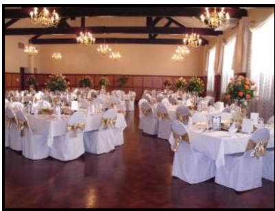
The tables and the layout were exceptionally done with ample space between guests.

So, instead of writing a long story of the evening I believe that "A picture can say a thousand words" so here are a few thousand words.